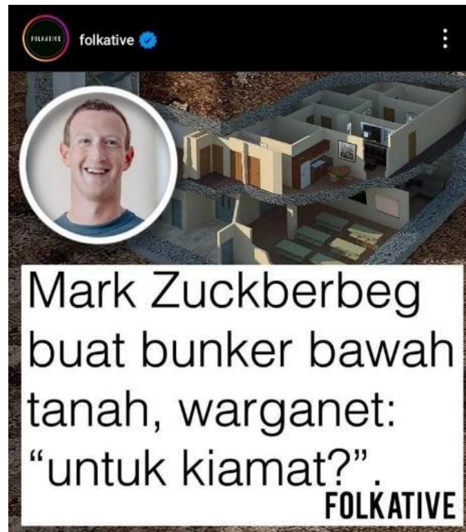
Figure 2. Folkative Visual Journalism Presentation

perspective underscores the significance of visual storytelling as a powerful tool in modern communication strategies, particularly in a digital landscape saturated with information. By leveraging the compelling nature of visuals, brands and content creators can effectively engage and persuade audiences, ultimately driving meaningful connections and achieving communication goals. (Walter, 2014).