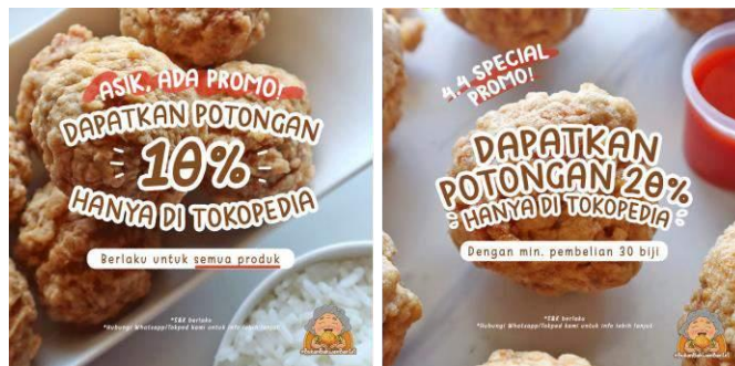
Picture 4 Instagram Feeds of Special Promotion

Based on research surveys, promos such as free shipping and other discounts, influence millennials to want to shop, because for them buying something is not triggered by need (Simamora & Fatira AK., 2019). Therefore, promo content is very suitable for the audience of the #BukanBakwanBantet campaign who are millennial Z generation.