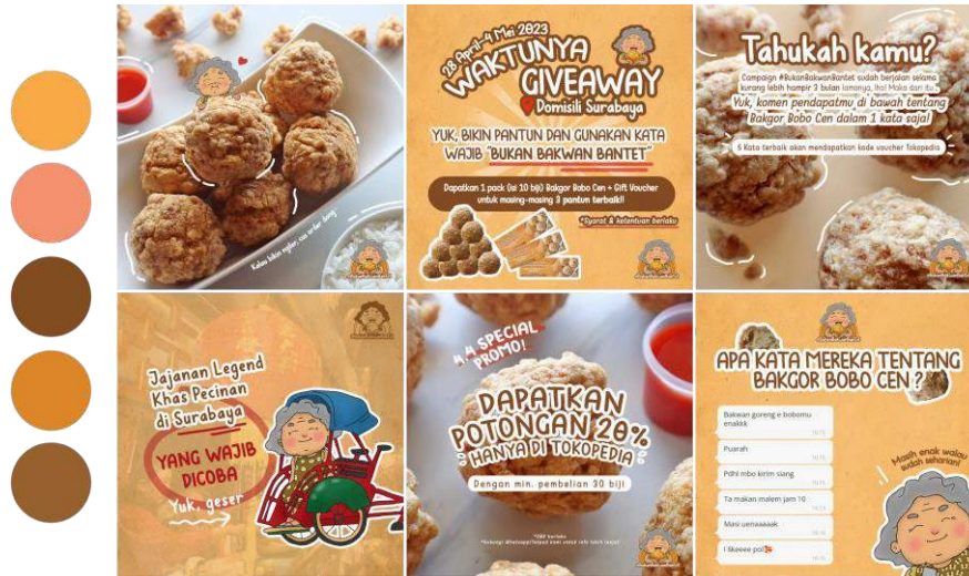
Picture 1 Design Moodboard for #BukanBakwanBantet's Campaign

The design style used by Bakgor Bobo Cen in the #BukanBakwanBantet campaign is a vector-based flat design, which displays a fun and playful, warm, and homie impression, because it uses a mascot as the design master. A mascot is a form or object that can be a person, animal, or other object that is considered to bring good luck and enliven the atmosphere of an event (Saniscara, 2020). The mascot design in the campaign is an illustration of the Bobo Cen figure itself, which aims to characterise the brand. In such intense market competition, a company must use phrases, words, or images that represent the company/brand to be different from other brands, so that it can be remembered well. Many advertising experts believe that one of the most effective brand representations is the mascot (Saniscara, 2020).