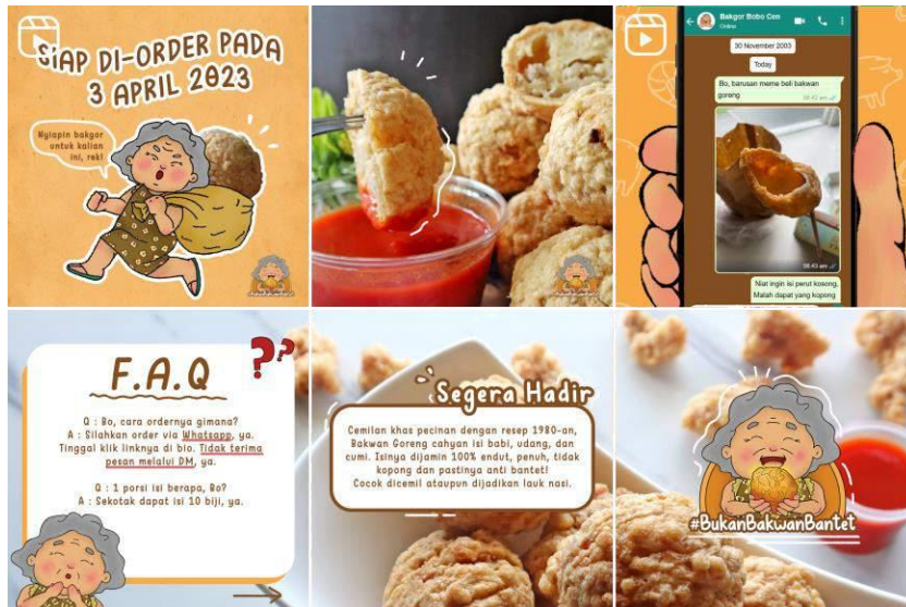
Picture 2 Instagram Feeds of Introduction to Brand Campaign