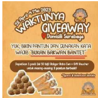
Picture 5 Instagram Feeds of Giveaway

With the giveaway, it is hoped that it can reach more audiences and potential customers. Based on research conducted by (Effendi & Anggrianto, 2020), the giveaway promotional strategy succeeded in attracting the attention of many audiences and adding brand awareness (Effendi & Anggrianto, 2020).