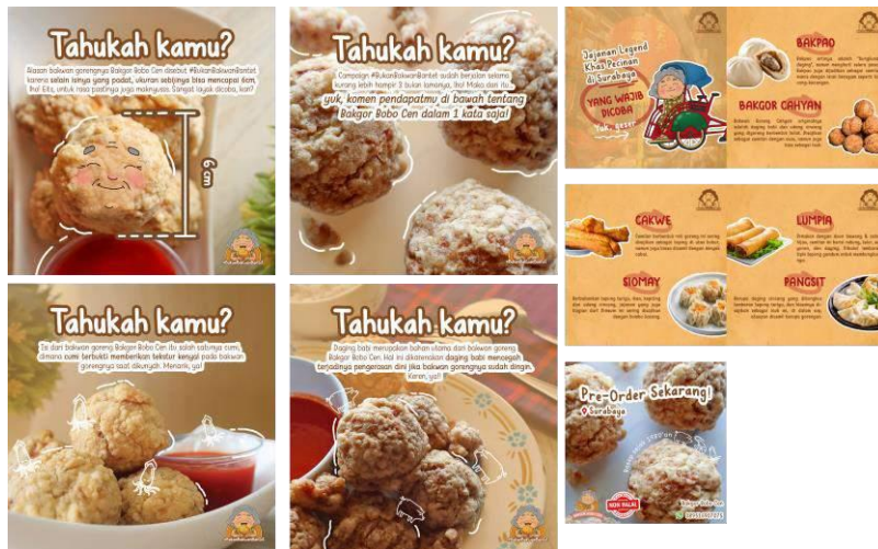
Picture 3 Instagram Feeds of “Did You Know?” Content