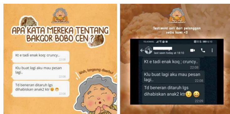
Picture 6 Instagram Feeds of Testimonial

In research conducted by (Alfirdausi & Marpaung, 2022), the existence of a review has a significant impact on the online purchasing decision process. So that with the original testimonial content from customers, it is hoped that it will attract potential consumers in considering trying to buy a product.