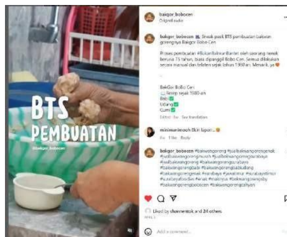
Picture 7 Instagram Reels of Behind The Scene : The Making of Product Source : Researcher documentation