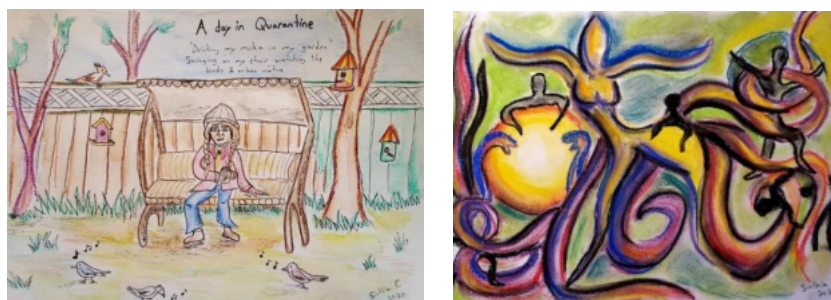
Figure 4 A Day in Quarantine Drawing.