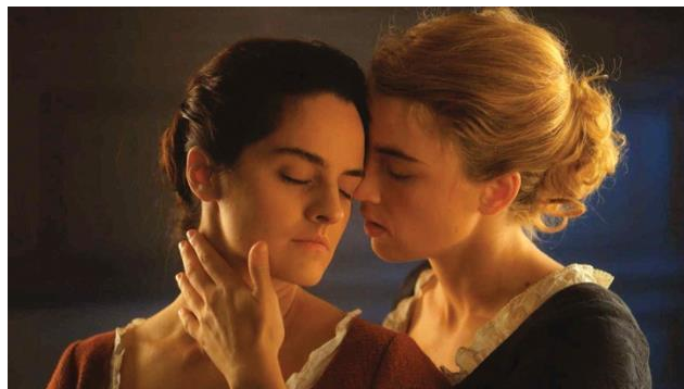
Figure 2 . Heloise and Marianne

Sciamma can show that a lesbian relationship is as normal as a heterosexual relationship and does not make it feel forced or shameful , as many films do. She portrays the relationship between Heloise and Marianne so naturally and is not an in-your-face attempt. The movie is set in the 1770s; Sciamma showed that being queer is normal and not something "new." It has always existed but has been overthrown and shamed by heteronormativity.