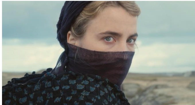
Figure 3 . Heloise