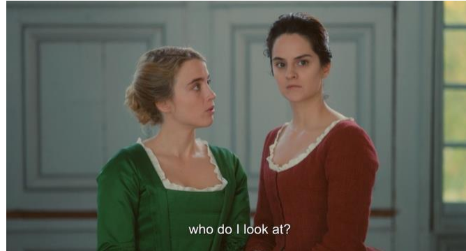
Figure 4 . Heloise and Marianne

not just Marianne's work but Heloise's. The scene ends with Heloise framed with a medium shot while Marianne is framed with a wide shot.