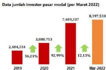
Figure 3. RI Capital Market Investor Data

For Commodity and Other Resources, Primary goods or products that can be traded in the market are referred to as commodities. Commodities themselves can include a wide range of goods, from agricultural produce to metals, energy, and other goods. These products are usually standardized and homogeneous, meaning they have the same quality, size, and other attributes across the globe.