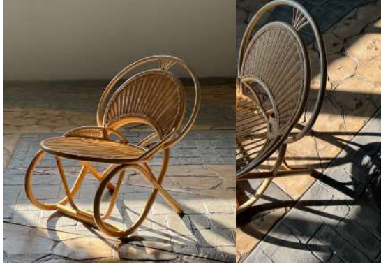
Figure 1. Rattan Chair

Differentiation can be formed for example, by using local material in design or in furniture that will be used or created by designers.